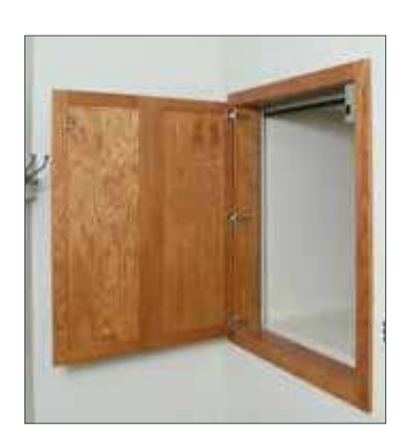
Dumbwaiters and Cargo Lifts