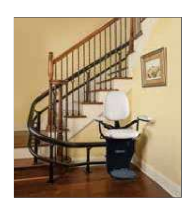
Curved and Straight Stair Lifts