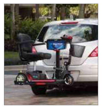
Multiple auto lift solutions for chair or scooter