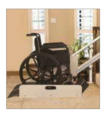
Incline Platform Lifts